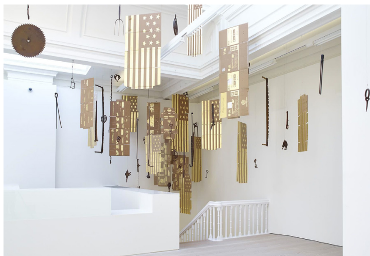
Danh Võ, Untitled (2015)

FREE TIME at the hotel, to refresh and change for the evening.