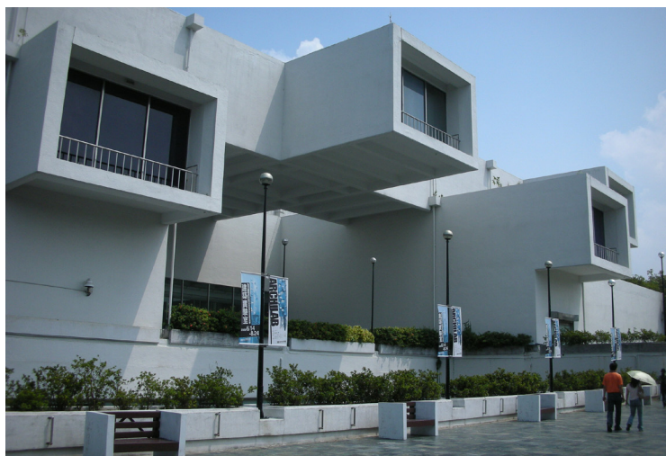
Taipei Fine Arts Museum