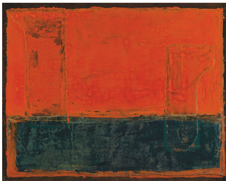
Su Xiaobai, Precipitating Azure (2007)