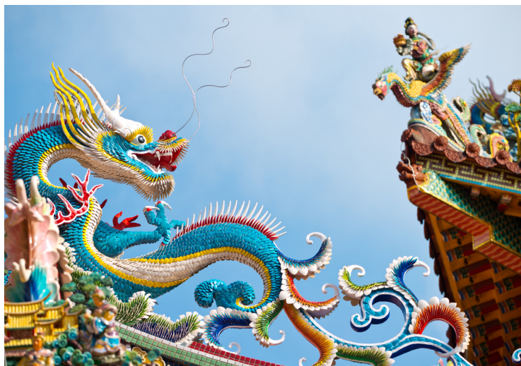
Baoyan temple detail