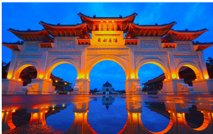
Chiang Kai-shek Memorial Hall

**Please see restaurant suggestions at the end of the program.