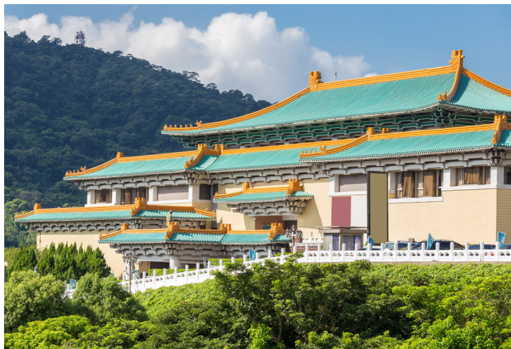
National Palace Museum