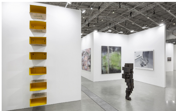
Dangdai Art Fair