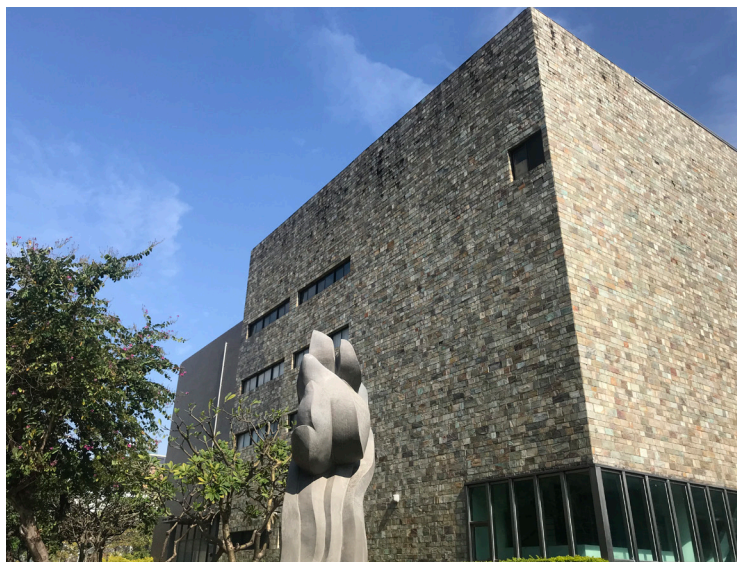
National Taiwan Museum of Fine Arts