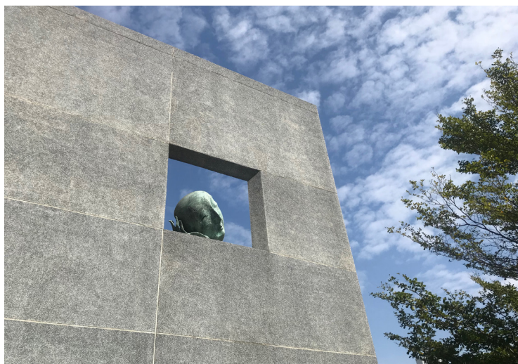
National Taiwan Museum of Fine Arts