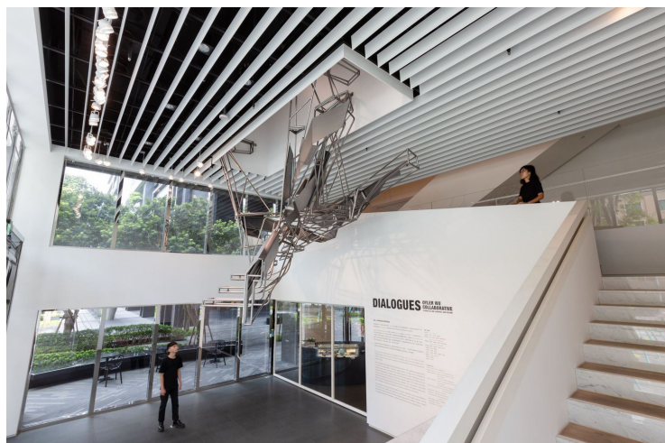
Jut Art Museum